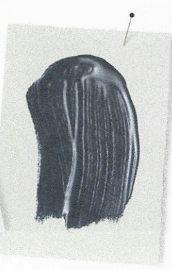
WC-90 FINE PAINTS OF EUROPE

"A small room is the perfect opportunity to embrace a color you're scared of—you don't have to make a huge commitment. I'd use this dark, moody blue on both the walls and woodwork. Then, on the ceiling, mix it with white in a one-to-three ratio so that the color continues across every surface."