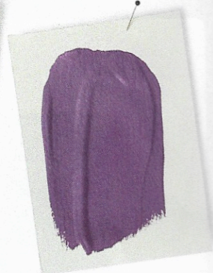
MATURE GRAPE SW 6286 SHERWIN-WILLIAMS

"Not too red, not too dark, and not too bright, this deep aubergine purple brings to mind orchids, calla lilies, and even purple artichokes. There's a regality about it that rings true to the royal, sophisticated associations purple has. It's a great complement to greens—from light sage to a kelly green—as well as yellow and sapphire blue."