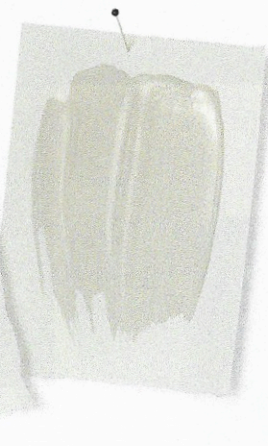
GRANITE DUST BEHR

"I placed this color—a pale gray that resembles a hazy sky—in a lacquered finish on the ceiling of a small black-and-white-striped foyer. The glossy effect is easier to get on a ceiling than on walls, while the reflective, mirror-like surface gives much-needed depth to the room. The shade is also a bit somber, which helped balance the bold walls."