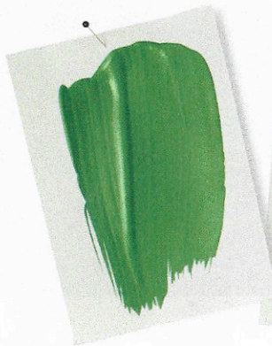
SEAWEED 2035-10 BENJAMIN MOORE

"I think every room needs a little green, even if it's just a plant in the corner. This seems to be my go-to green; I used it in the vestibule of my Chicago apartment with a black-and-white checkerboard floor and white plaster trim. It reminds me of a boxy green Volvo I had in the '80s—bright, cheery, and fearlessly colorful!"