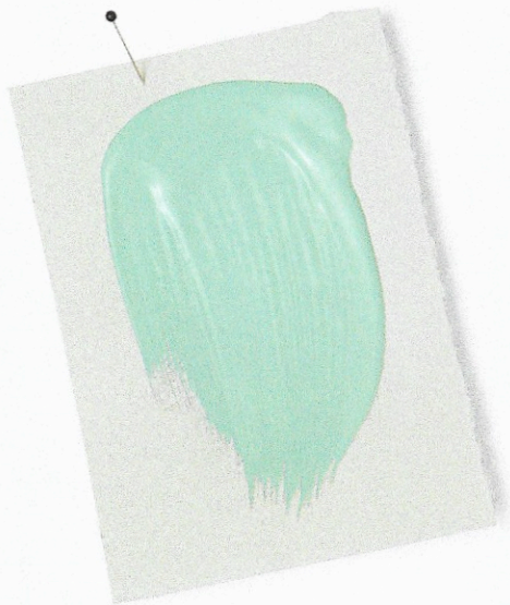
OCEAN SPRAY 2047-60 BENJAMIN MOORE

"I chose this pale aqua for a tiny studio—less than 300 square feet—in downtown Brooklyn. Painting it white or beige would have just screamed 'rental.' This is a happy, clear color that looks pretty on both bright summer days and throughout the dreary New York winter. And the client and I are both water signs, so the color felt apropos!"